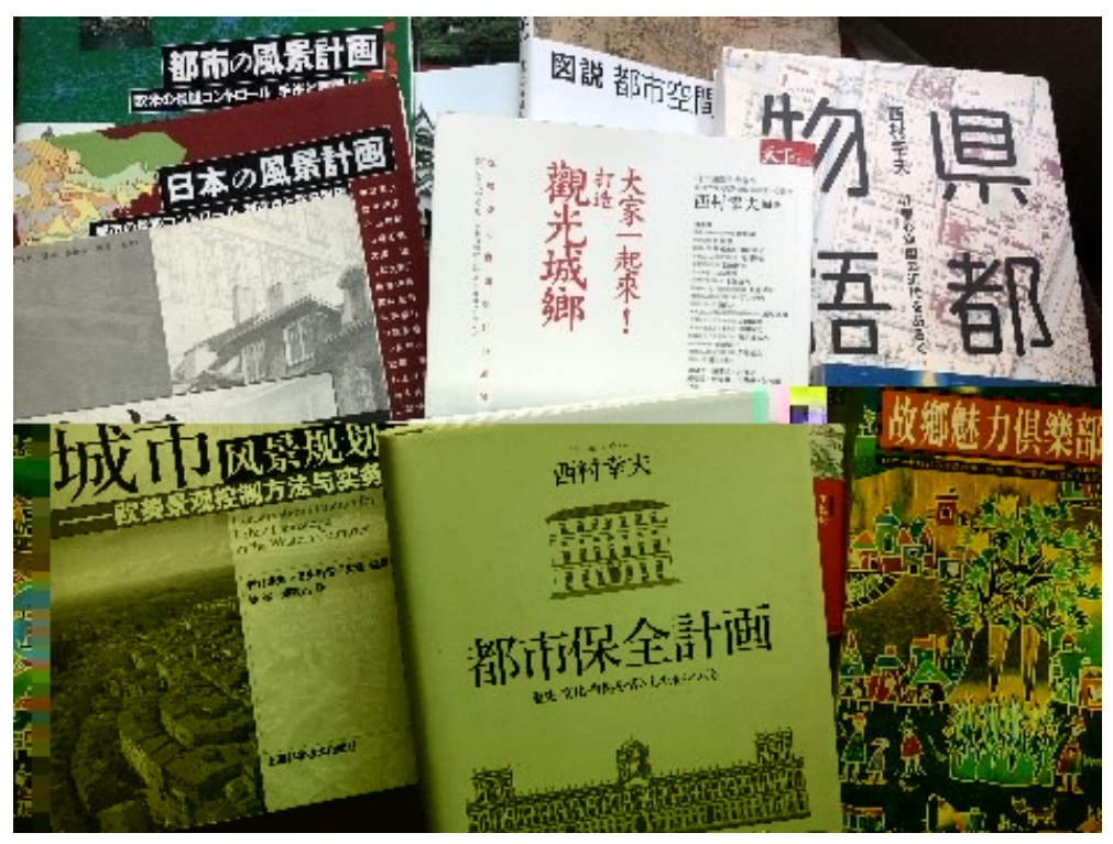
N shimura Publications