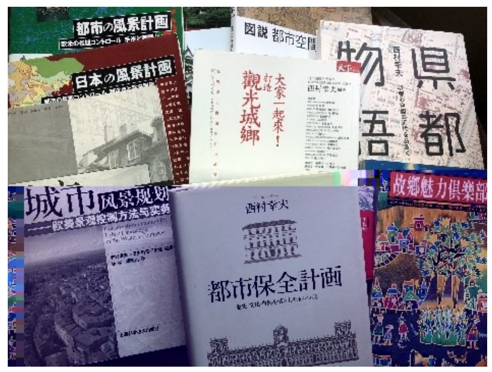
N shi mura Publications